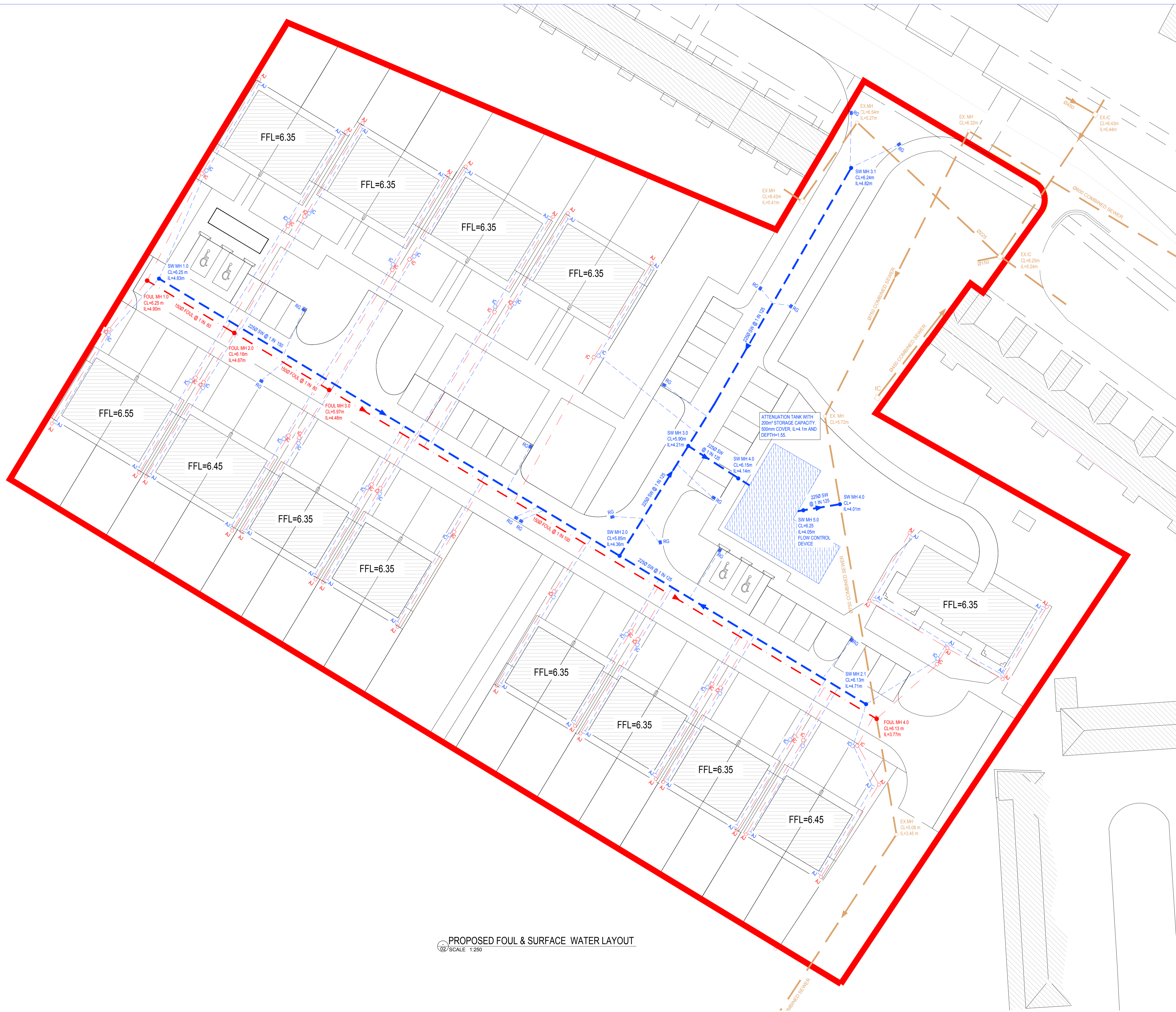
PROPOSED FOUL & SURFACE WATER LAYOUT SCALE: 1:250