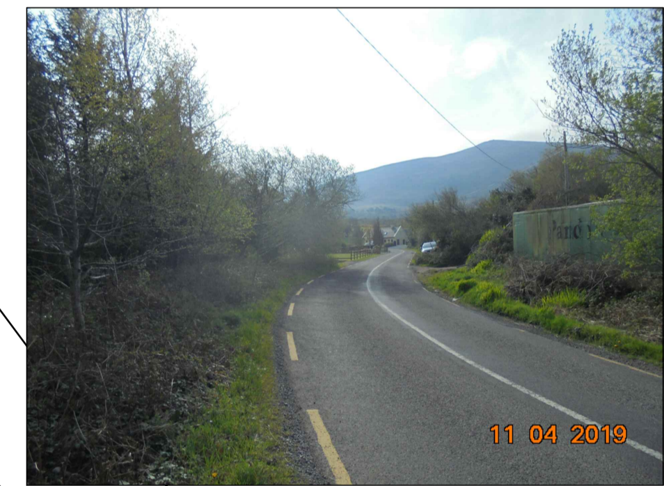
VIEW FROM PROPOSED ENTRANCE TO LEFT HAND SIDE